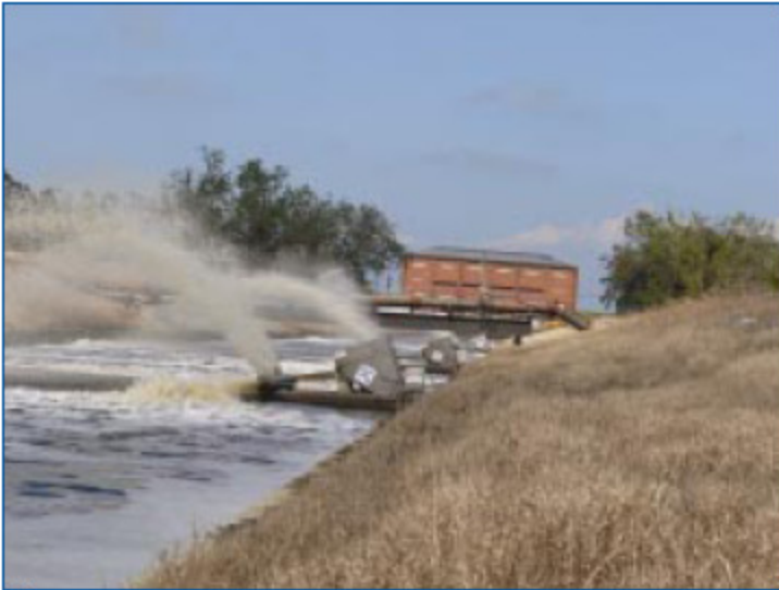
Three 25 HP Airmasters Citrus Canal