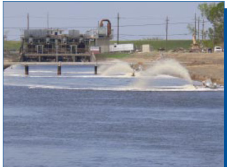
One 50 HP Airmaster & Two 25 HP Airmasters Jahnke Canal